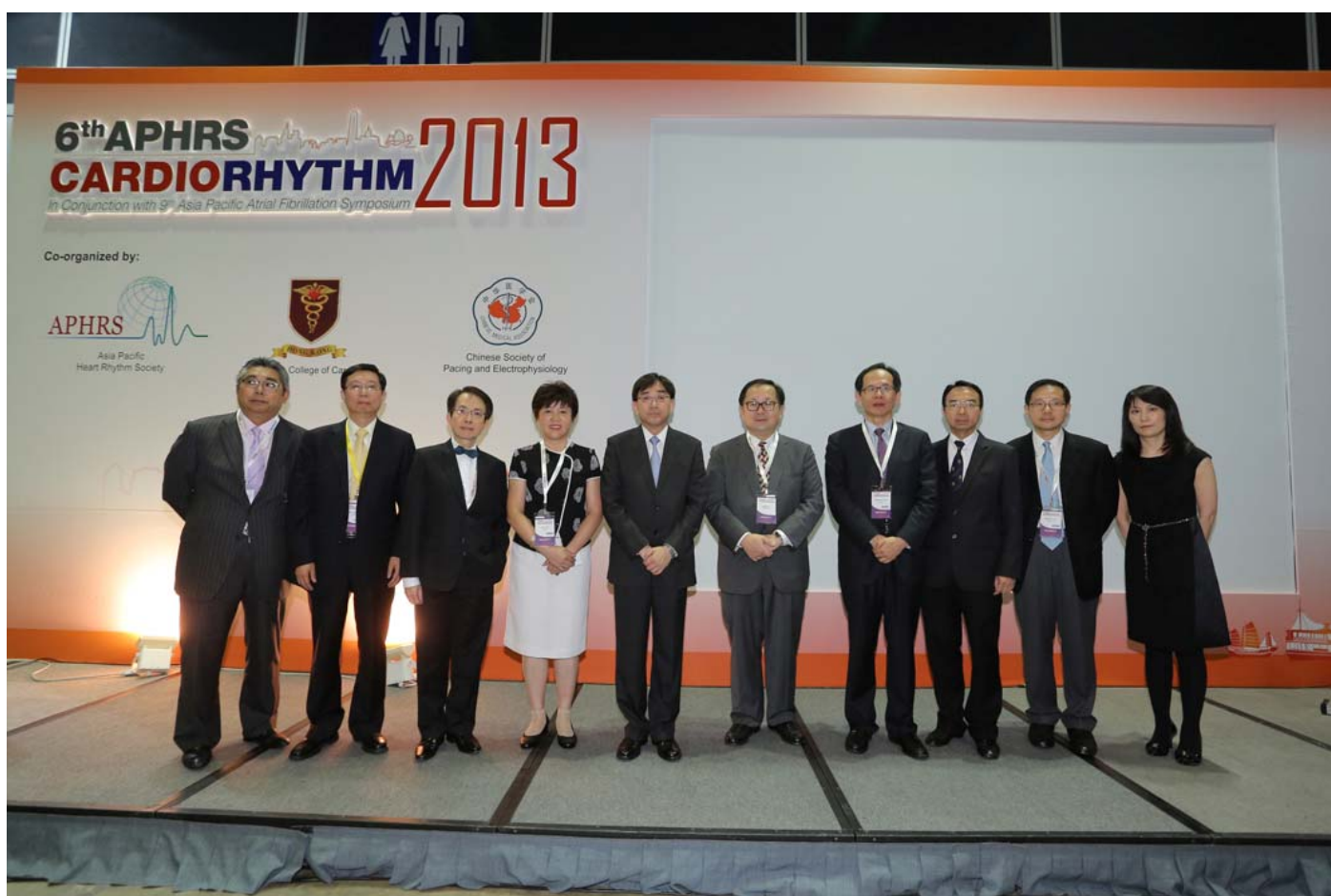
Opening Ceremony on 3 October 2013, Hong Kong